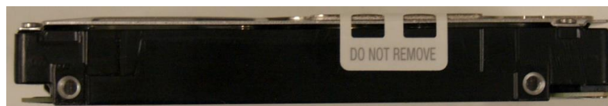
Figure 5: Left-side view of tamper-evidence label on left side of Enterprise Performance HDD v6, 2.5-Inch, 15K-RPM, SAS Interface module