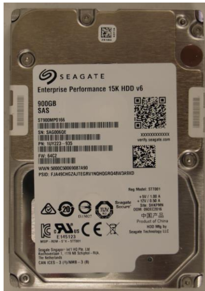
Enterprise Performance® HDD v6, 2.5", 15K-RPM, SAS Interface, 900GB, 600GB