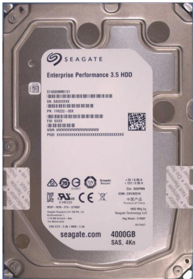
Enterprise Performance® HDD v1, 3.5", 10K-RPM, SAS Interface, 4000GB

This document is non-proprietary and may be reproduced in its original entirety.