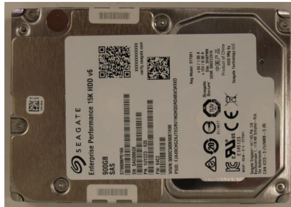
Figure 4: Top view of tamper-evidence label on sides of Enterprise Performance HDD v6, 2.5-Inch, 15K-RPM, SAS Interface module