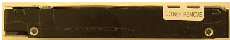
Figure 8: Left-side view of tamper-evidence label on left side of Enterprise Performance HDD v9, 2.5-Inch, 10K-RPM, SAS Interface module