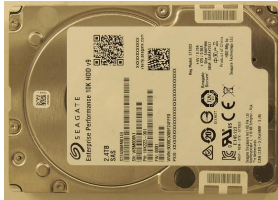
Figure 7: Top view of tamper-evidence label on sides of Enterprise Performance HDD v9, 2.5-Inch, 10K-RPM, SAS Interface module