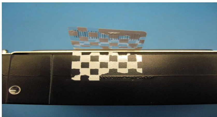
Figure 10: Enterprise Performance HDD v1, 3.5-inch, 10K-RPM, SAS Interface & Enterprise Performance HDD v6, 2.5-Inch, 15K-RPM, SAS Interface module Top Cover Tamper Evidence