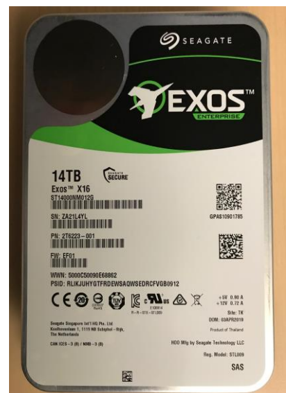
Exos™ X16 Enterprise, 3.5", 7.2 K-RPM, SAS Interface, 14TB