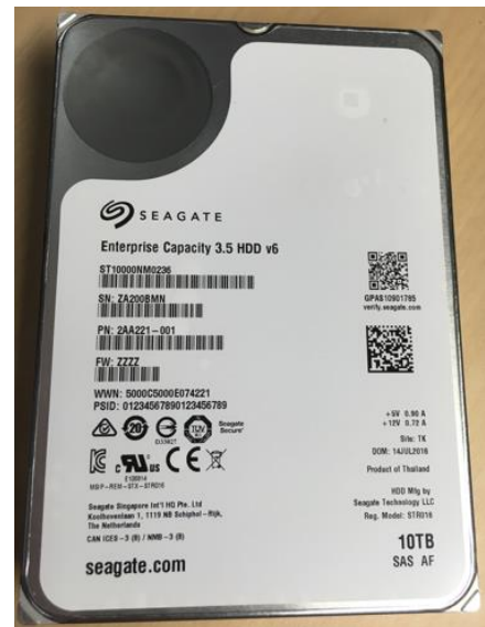
Enterprise Capacity® HDD v6, 3.5", 7K-RPM, SAS Interface, 10,000GB