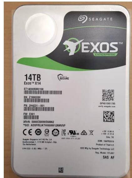
Exos™ X14 Enterprise, 3.5", 7.2 K-RPM, SAS Interface, 14TB