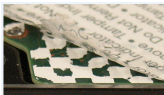
Figure 11: Enterprise Performance HDD v1, 3.5-inch, 10K-RPM, SAS Interface, Enterprise Performance HDD v6, 2.5-Inch, 15K-RPM, SAS Interface, Enterprise Capacity HDD v6, 3.5-inch, 7K-RPM, SAS Interface module PCBA Tamper Evidence. Label lifted off.