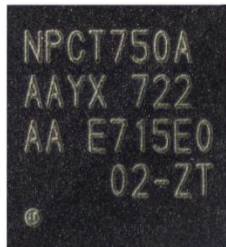
Figure 1. LAG019 in QFN32 Package