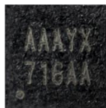
Figure 2. LAG019 in UQFN16 Package