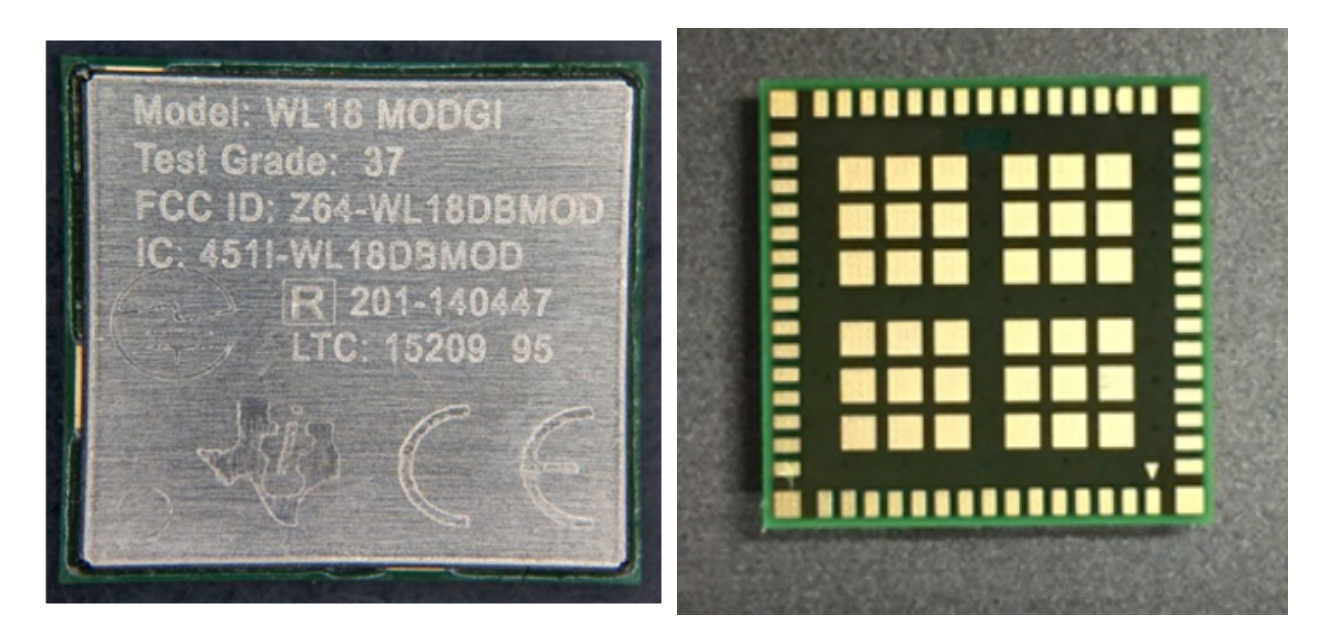
Figure 2 – Front and back views of the TI WiLink<sup>™</sup> 8 chip.