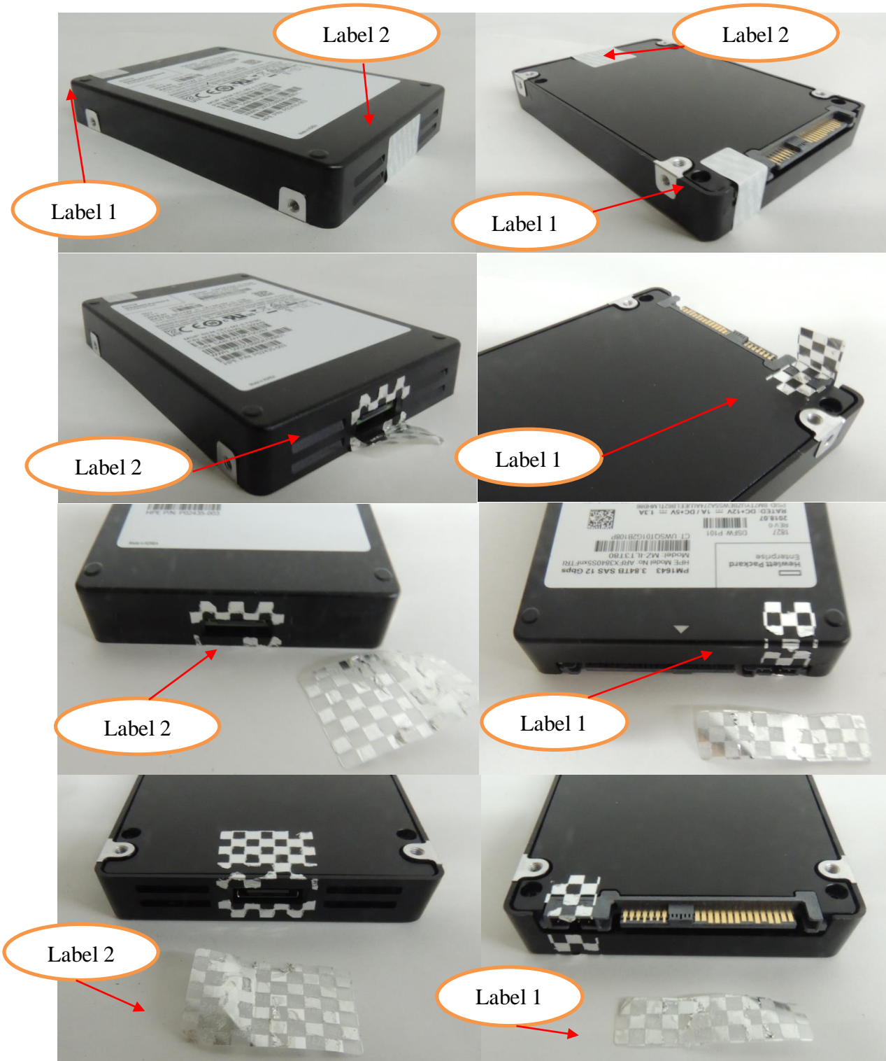
Exhibit 15 - Signs of Tamper