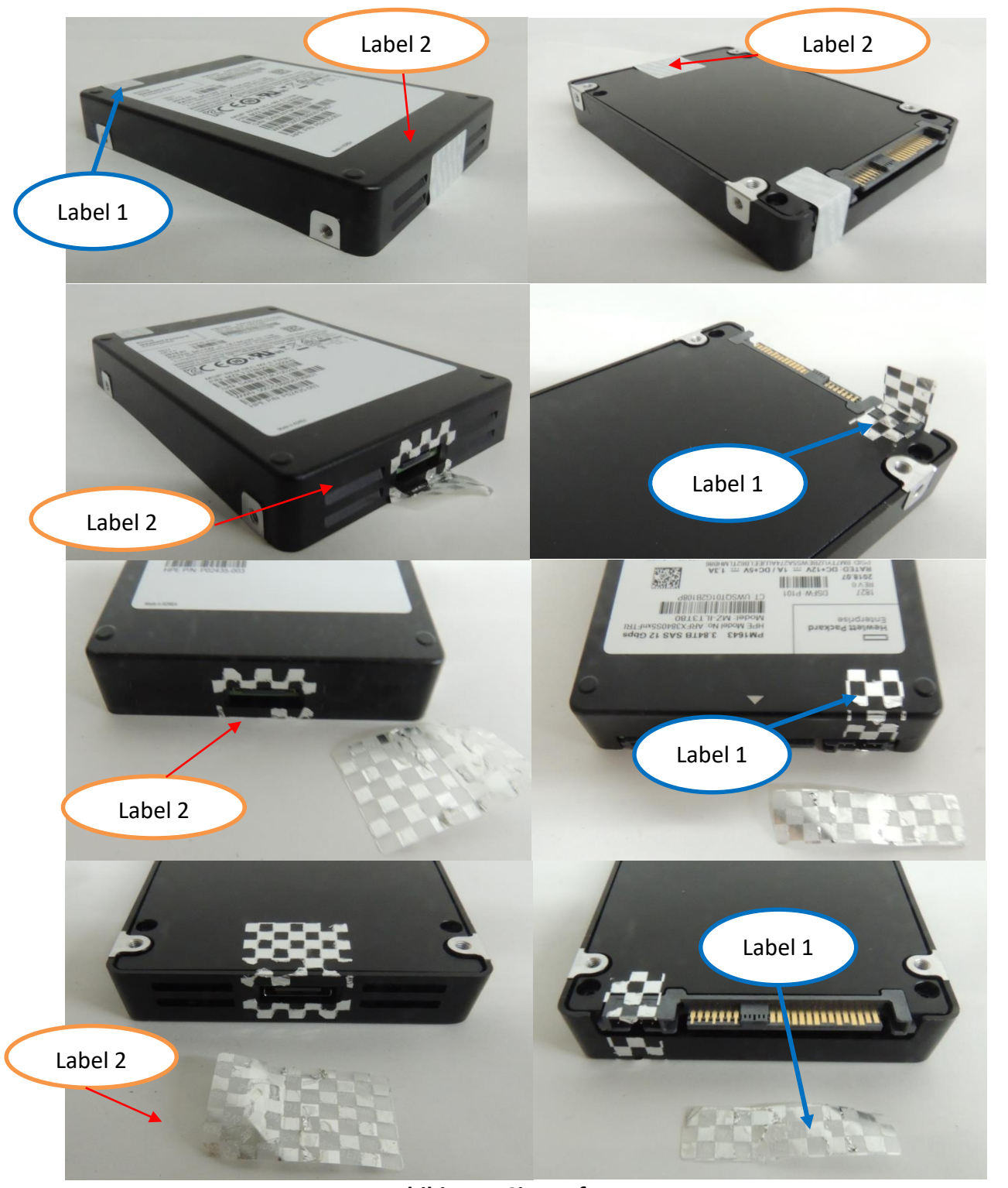
Exhibit 15 - Signs of Tamper