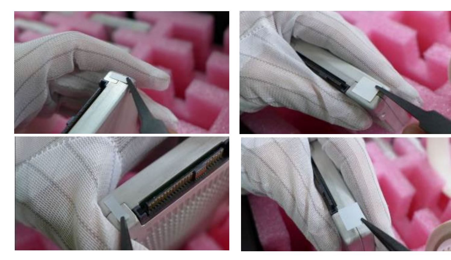
Figure 7 Applying Tamper-Evident Seals