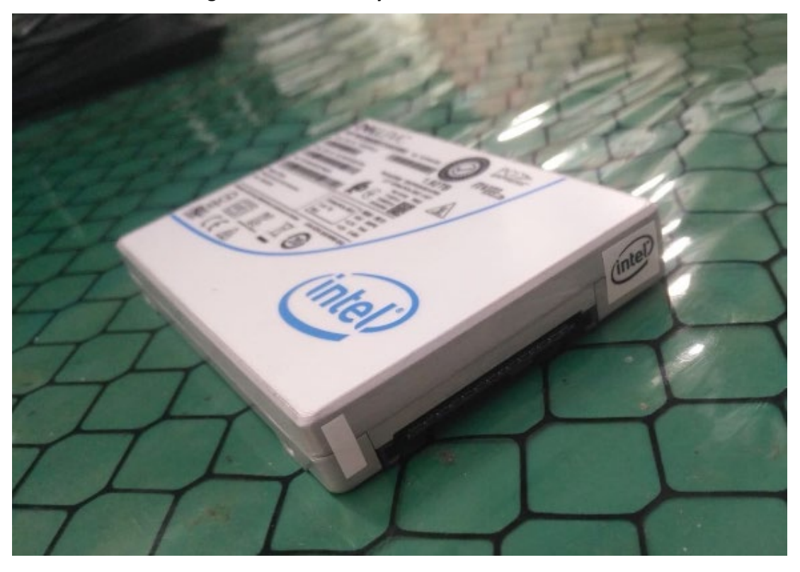
Figure 4 – Module Physical Enclosure - Isometric