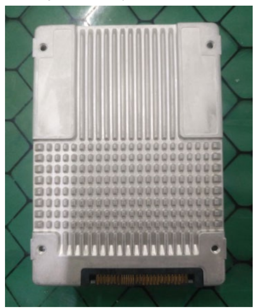
Figure 6 – Module Physical Enclosure - Bottom

The following table summarizes the actions required by the Cryptographic Officer Role to ensure that physical security is maintained: