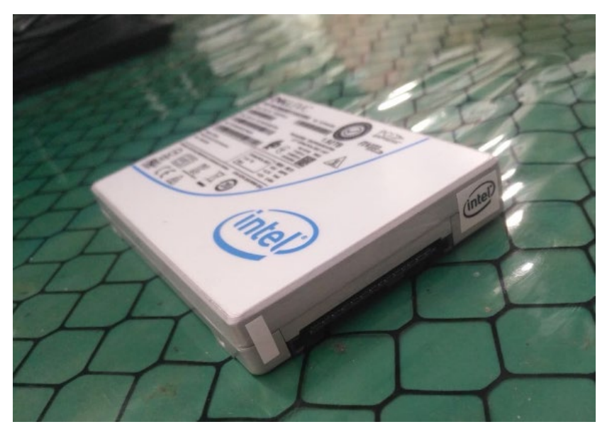
Figure 1 Module Picture

The Module is designed to be embedded in a General Purpose Computer (host) and is connected through the PCIe connector. The physical form of the Module is depicted in Figure 1.