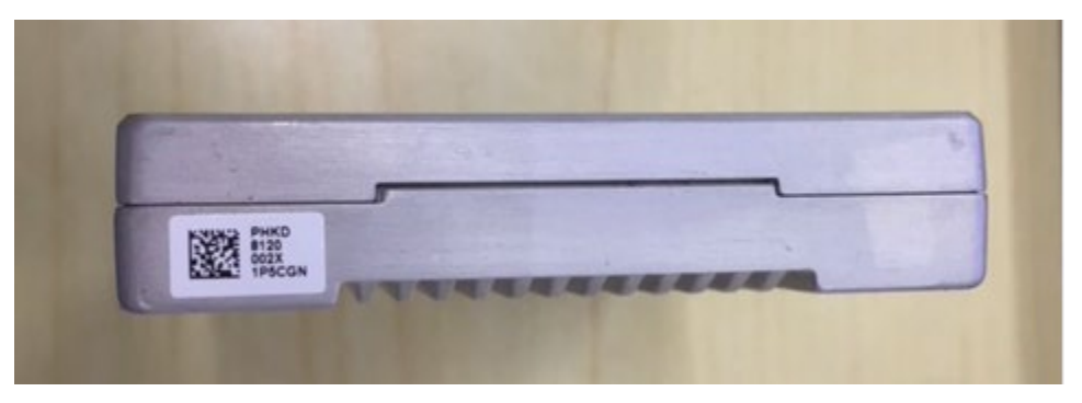
Figure 5 – Module Physical Enclosure - Back