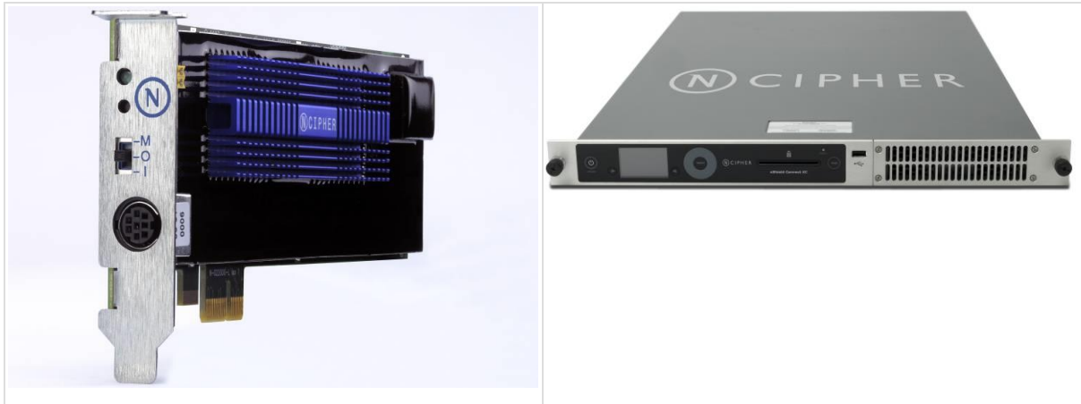
Table 2 nShield Solo (left) and nShield Connect (right)

The cryptographic boundary is delimited in red in the images in the table below. It is delimited by the heat sink and the outer edge of the potting material on the top and bottom of the PCB.