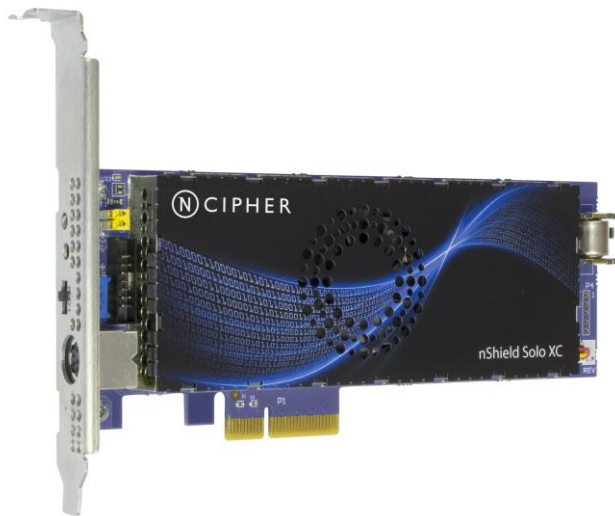
Figure 1 nShield Solo XC

The Figure below shows the nShield Solo XC HSM.