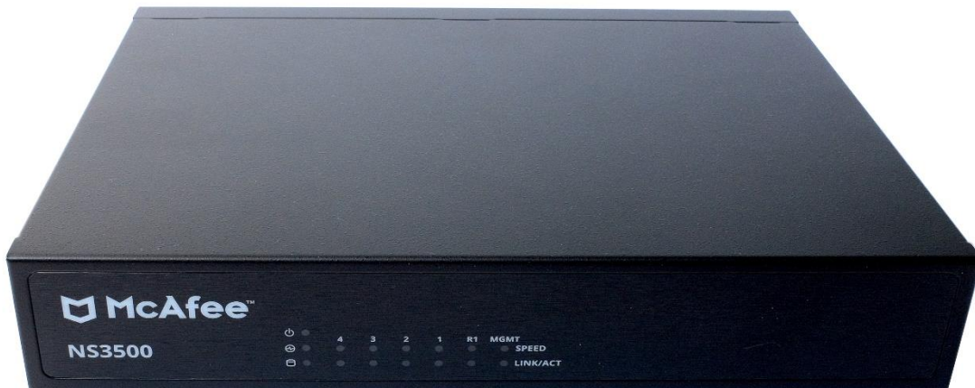
Figure 1 – Images of NS3500

Figure 1 shows the module configuration and the cryptographic boundary.