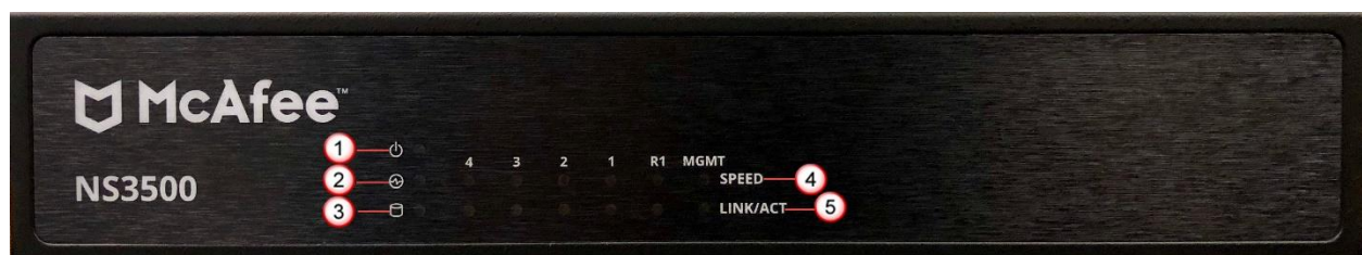
Figure 2 – NS3500 Front Panel

Figures 2 and 3 show the modules' front and rear panels and Tables 2 and 3 list the modules' ports and interfaces.