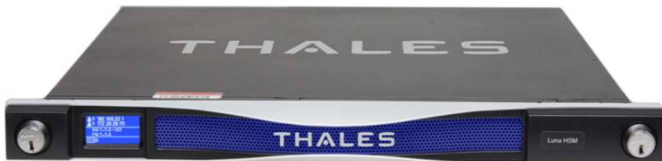
Figure 2: Thales Luna Network HSM