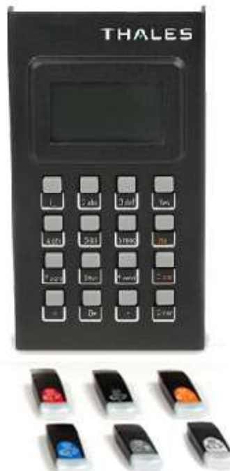
Figure 3: Thales Luna PIN Entry Device (PED) and iKey