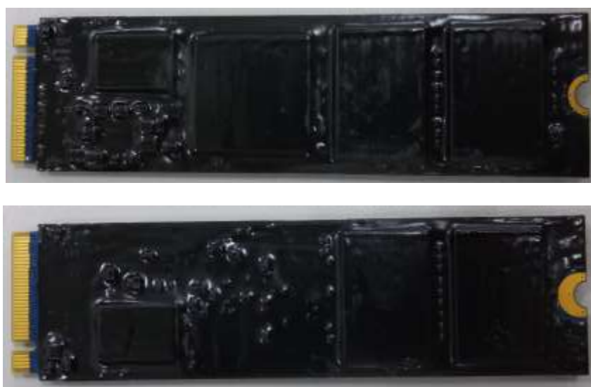
Exhibit 2 - Specification of the Seagate BarraCuda 515 Cryptographic Boundary (From top to bottom: top side, bottom side).