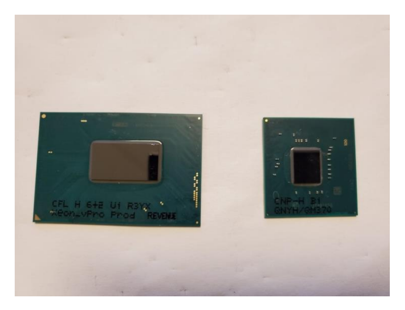
Figure 1b – Intel Cannon Point PCH with Coffee Lake (CFL) chipset