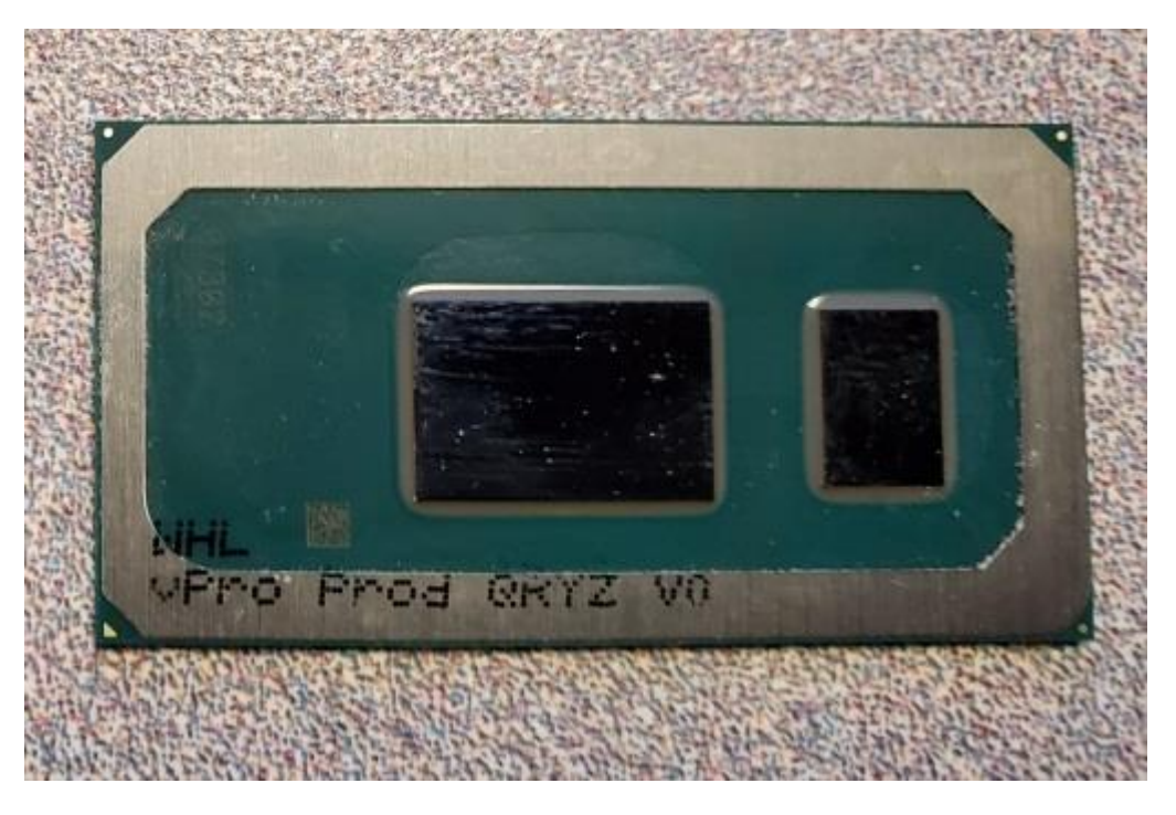
Figure 1a – Intel Cannon Point PCH with Whiskey Lake (WHL) chipset