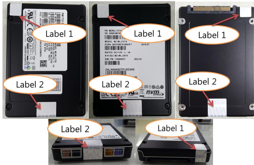
Exhibit 15 – Tamper Evident Label Placement