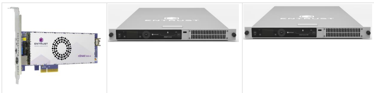
Table 3 nShield Solo XC (left), nShield Connect XC (centre), and nShield HSM i (right)

The table below shows the nShield Solo XC HSM, the nShield Connect XC and the nShield HSM i appliances.