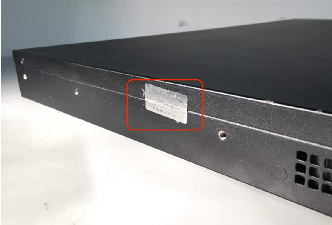
Figure 2 - SMA 6210/7200/7210 Tamper Seal #1 - Chassis Seam