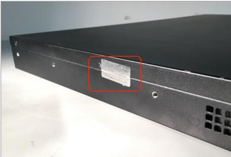
Figure 2 - CSa 1000 Tamper Seal #1 - Chassis Seam