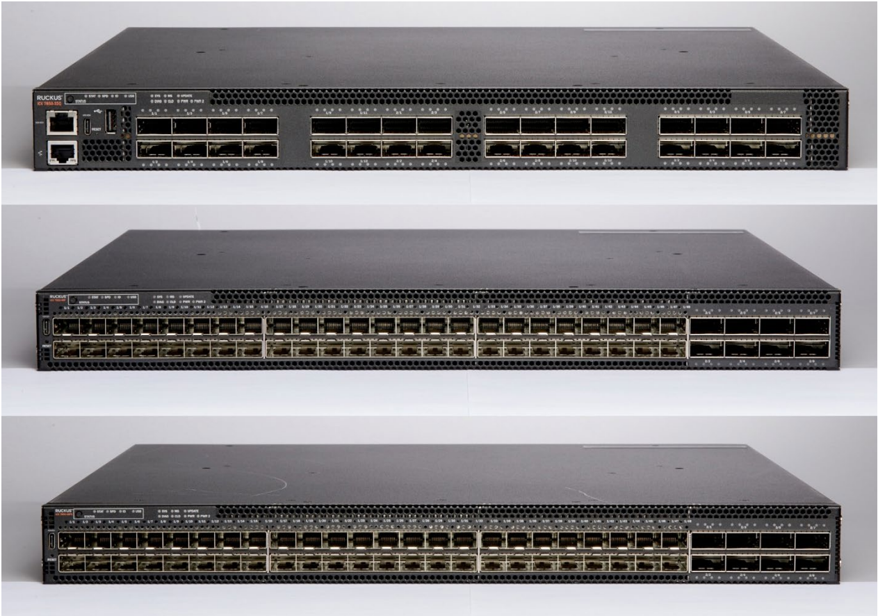
Figure 2 - ICX 7850 (Front)