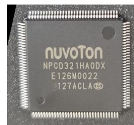
Figure 3: Nuvoton NPCD321HA0DX