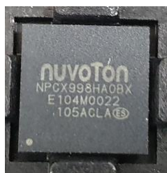
Figure 2: Nuvoton NPCX998HA0BX

Figure 2 and 3 shows a picture of the NPCX998H (e.g., EC) and the NPCD321H (e.g., SIO) in which the sub-chip module is embedded.