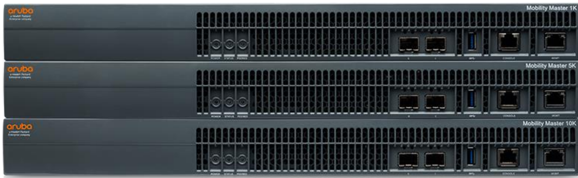
Figure 1 – Mobility Master Appliances

Figure 1 shows the front of the three Mobility Master Appliances (1K, 5K, 10K variants), and illustrates the following: