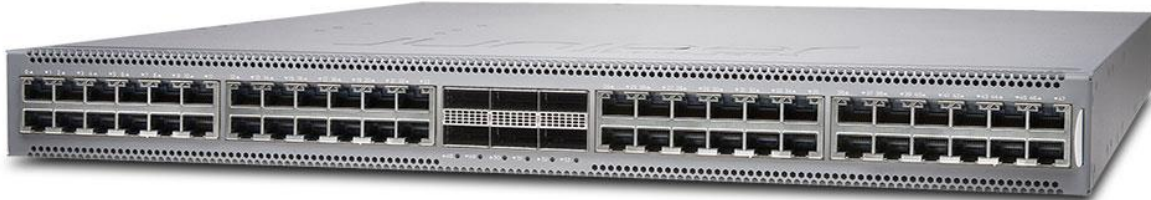
Figure 1 - QFX 5120-48T front view

The physical forms of the module are depicted in Figure 3 to Figure 10. The module is completely enclosed in a rectangular nickel or clear zinc coated, cold rolled steel, plated steel and brushed aluminum enclosure. For all models, the cryptographic boundary is defined as the outer edge of the switch chassis. The module does not rely on external devices for input and output of critical security parameters (CSPs).