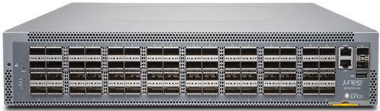
Figure 7 - QFX 5210-64C front view