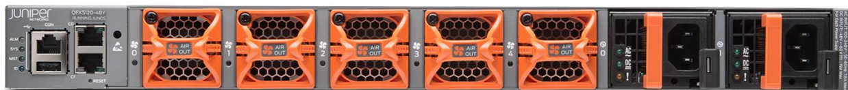
Figure 4 - QFX 5120-48Y rear view