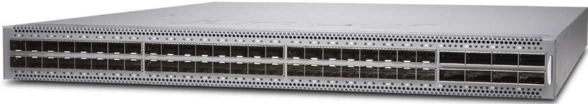
Figure 9 - EX 4650-48Y front view