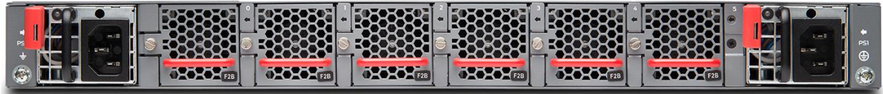
Figure 6 - QFX 5120-32C rear view