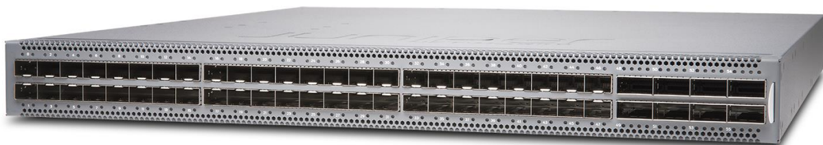
Figure 3 - QFX 5120-48Y front view