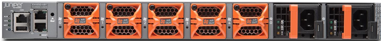
Figure 10 - EX4650-48Y rear view

The following table maps each logical interface type defined in the FIPS 140-2 standard to one or more physical interfaces.