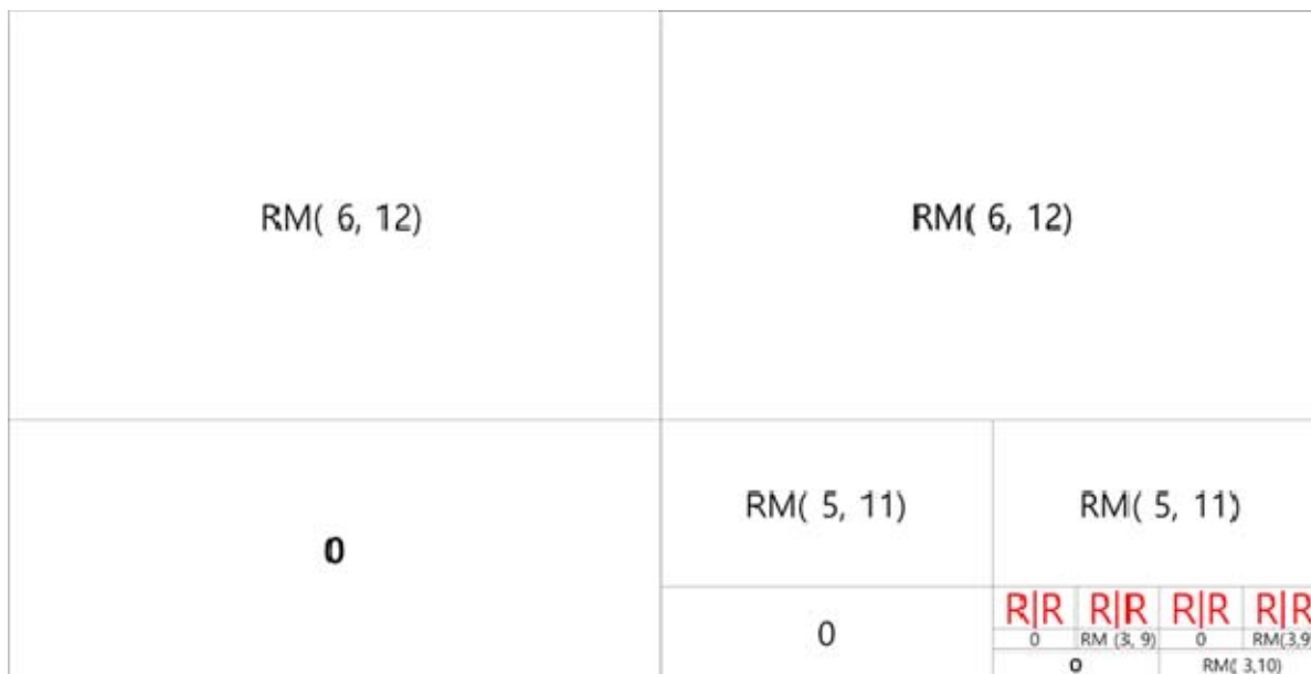
Fig. 1. Generator matrix of modified RM code