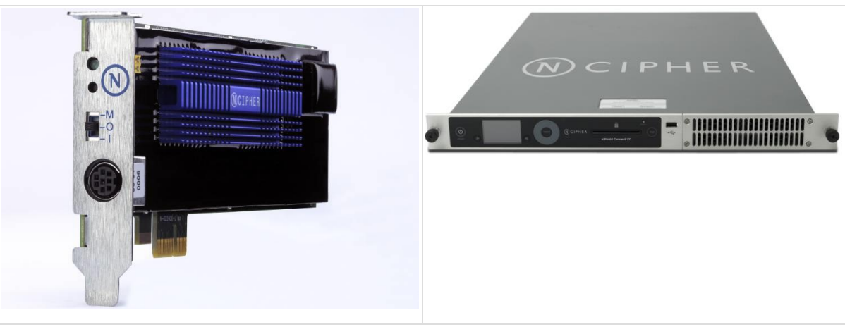
Table 2 nShield Solo (left) and nShield Connect (right)

The cryptographic boundary is delimited in red in the images in the table below. It is delimited by the heat sink and the outer edge of the potting material on the top and bottom of the PCB.