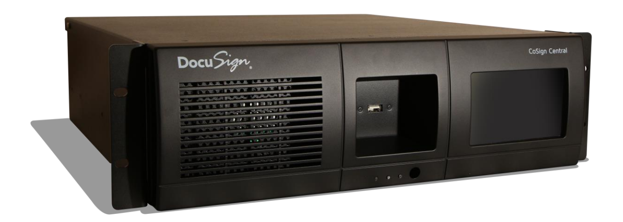
Figure 1 - DocuSign Signature Appliance

Starting for DocuSign Signature Appliance version 9.0.9.10, it is possible to install the Appliance in an HSM style where a user of the Appliance can also have Symmetric encryption/decryption keys such as AES in addition to using RSA keys.