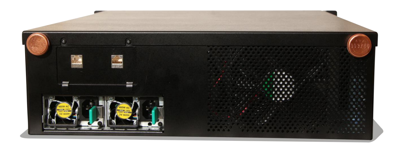
Figure 2 - Tamper Evident cans

The Tamper Evident cans are shown in Figure 2.