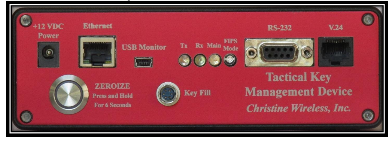
Figure 2: TKMD Front Panel