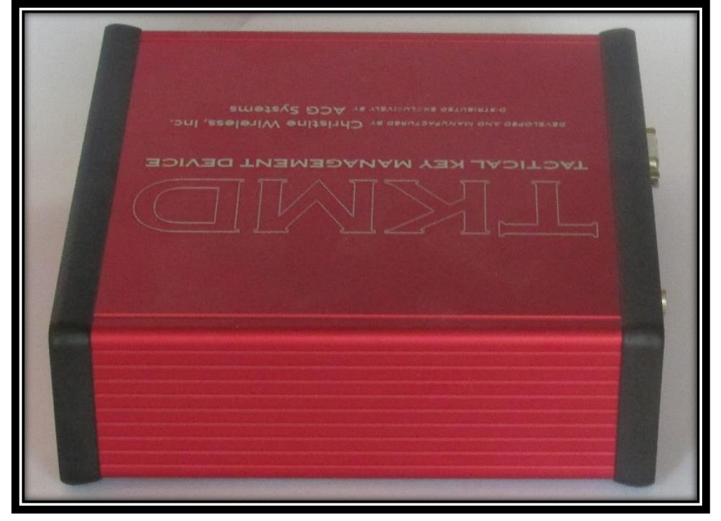
Figure 4: TKMD Top and Left Side View

© Copyright 2021 Christine Wireless, Inc.