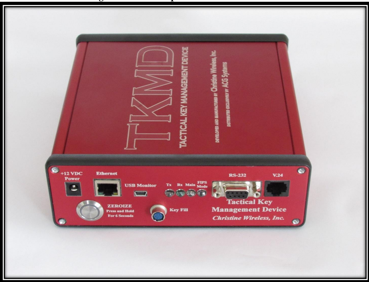
Figure 1: TKMD Top and Front View