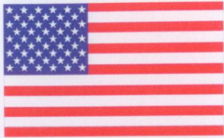
The National Institute of Standards and Technology of the United States of America