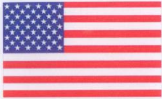
The National Institute of Standards and Technology of the United States of America