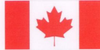
The Communications Security Establishment of the Government of Canada