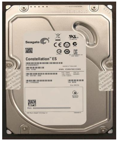
Seagate Secure Constellation® ES and Constellation®.2 Self-Encrypting Drives FIPS 140 Module Security Policy