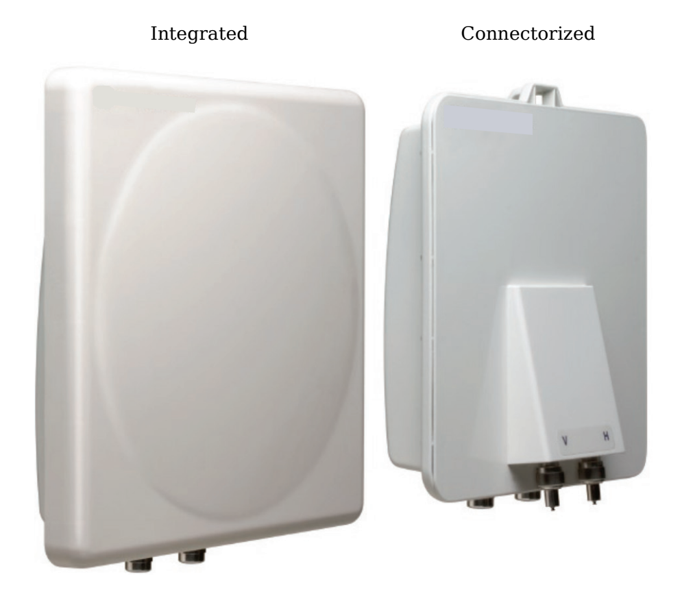
Figure 1 - PTP 600 Wireless Units