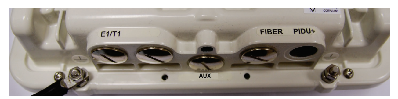
Figure 3 - Port identification