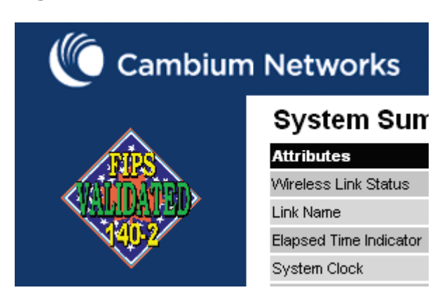
Figure 6 - Indication of FIPS 140-2 capability

The FIPS logo on its own is not an indicator of correct FIPS configuration. The logo is present when the operator has a correct hardware, software and license line-up to allow FIPS mode. The operator must follow the procedure outlined in Section 3.2 to enter approved mode. When in approved mode, the FIPS logo will be displayed and the alarm that is used to indicate incorrect configuration will not be asserted.