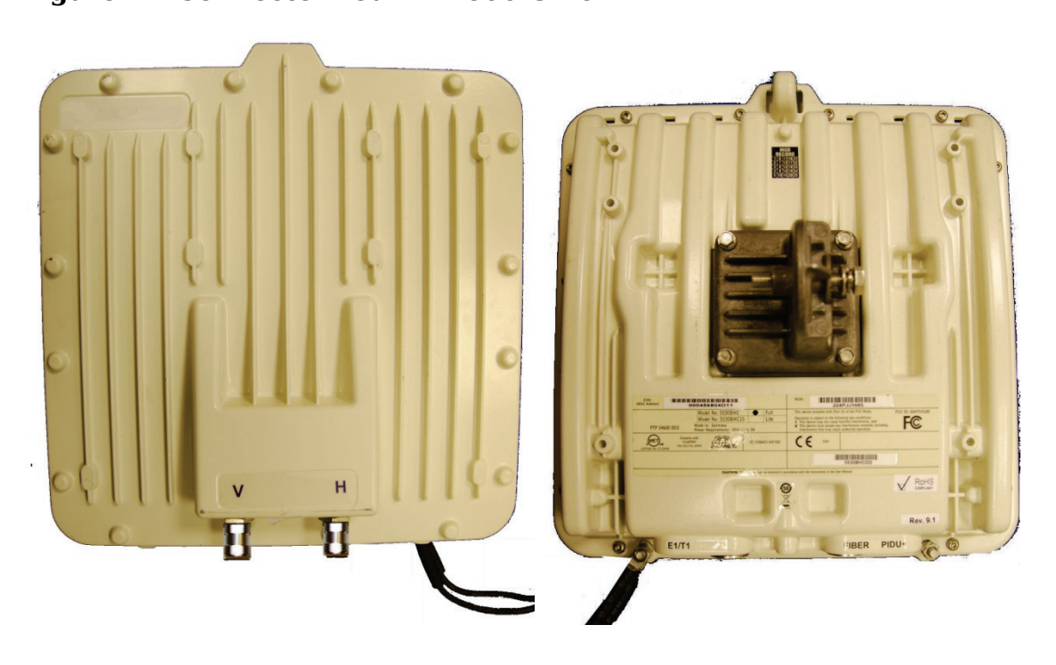
Figure 4 - Connectorized PTP 600 Unit