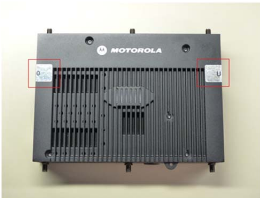
Figure 5 - Location of Two (2) Tamper-Evident Seals on Top Side