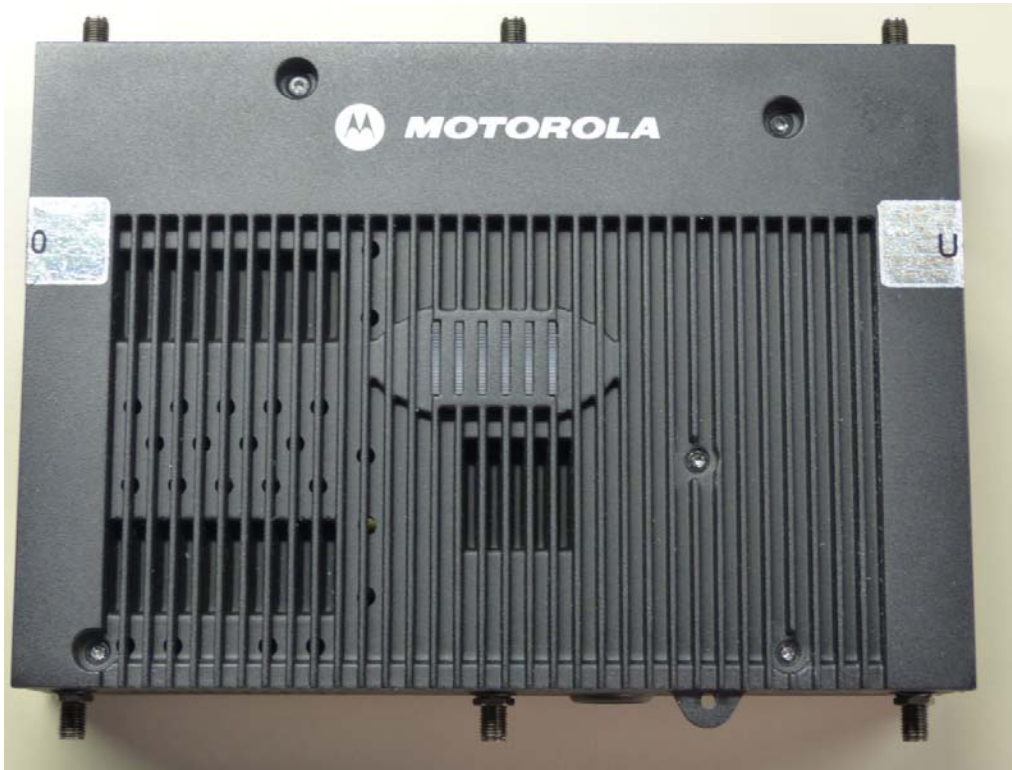
Figure 2 - Wireless Access Point AP-7131N-GR, Top View

Figures 2 through 4 depict the Wireless Access Point AP-7131N-GR. The antennas are not shown but connect to the three (3) antenna ports on both the front side and back side of the Module. Table 3 describes the Wireless Access Point AP-7131N-GR ports and interfaces.