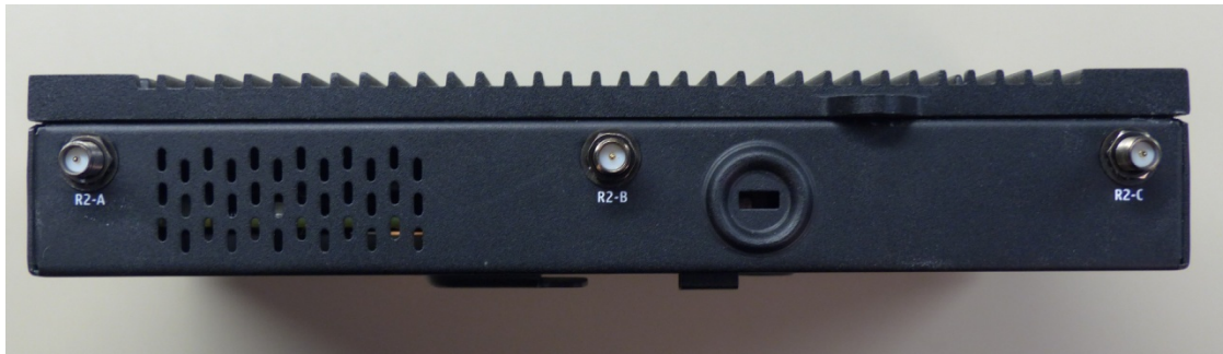
Figure 4 - Wireless Access Point AP-7131N-GR, Back Side