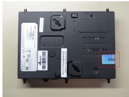
Figure 6 - Location of One (1) Tamper-Evident Seal on Underside