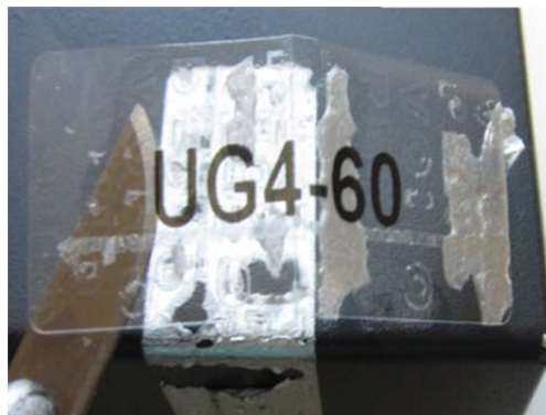
Figure 7 - Tampered Seal