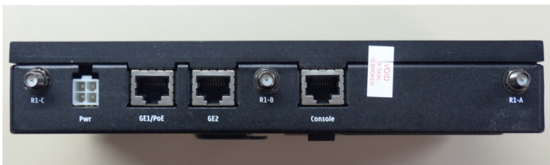
Figure 3 - Wireless Access Point AP-7131N-GR, Front Side