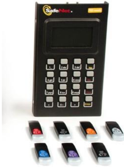
Figure 3-1. Luna PED and iKeys