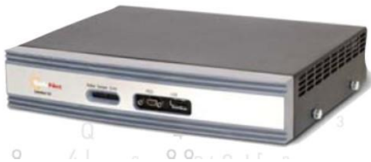
Figure 2-1. Luna Backup HSM Cryptographic Module (with front bezel attached)

This Security Policy is specifically written for the Luna Backup HSM cryptographic module in a Trusted Path Authentication (FIPS Level 3) configuration.