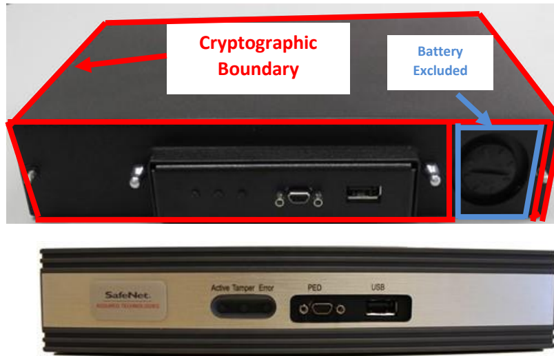
Figure 2-2. Luna Backup HSM Cryptographic Boundary (with front bezel removed)