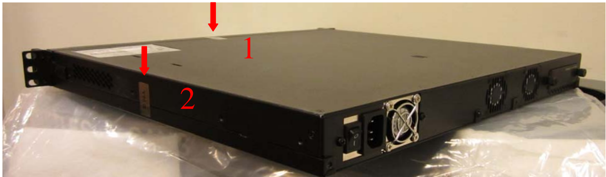
Figure 3 - NSA 3600/4600/5600 Rear with Two Tamper-Evident Seals