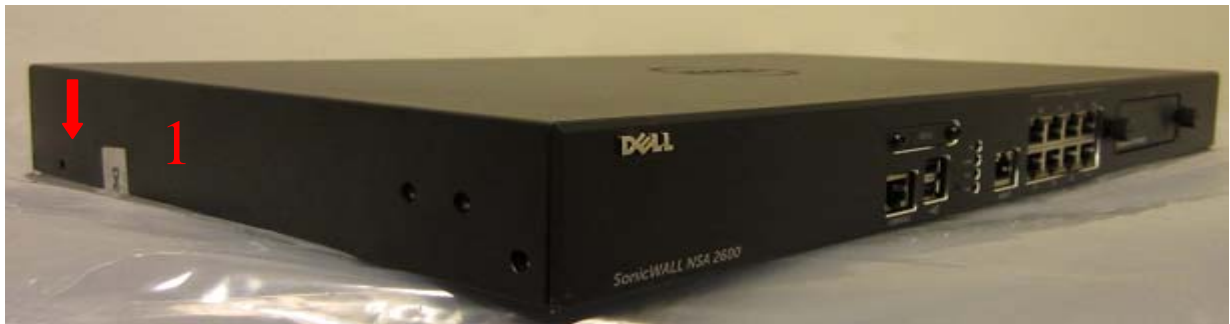
Figure 1 - NSA 2600 Front with Tamper-Evident Seal on Left Side

The chassis of the modules are sealed with one (1) or two (2) tamper evident seals: one (1) tamper-evident seal for the NSA 2600 and two (2) tamper-evident seals for the NSA 3600, 4600 and 5600, which are applied during manufacturing. The physical security of the module is intact if there is no evidence of tampering with the seals. The locations of the tamper-evident seals are indicated by the red arrows in the figures below. The Cryptographic Officer shall inspect the tamper seals for signs of tamper evidence once every six months. If evidence of tamper is found, the Cryptographic Officer is requested to follow their internal IT policies which may include either replacing the unit or resetting the unit to factory defaults. For further instructions on resetting to factory defaults, please review Sonicwall guidance documentation.