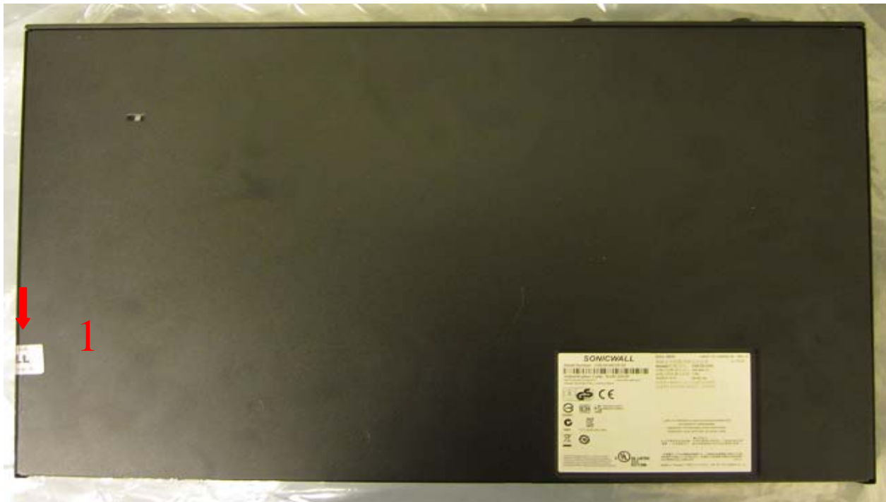
Figure 2 - NSA 2600 Underside/Bottom (same seal)