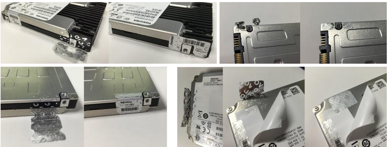
Mark of alphabetic character(s) which constitute a word “VOID”