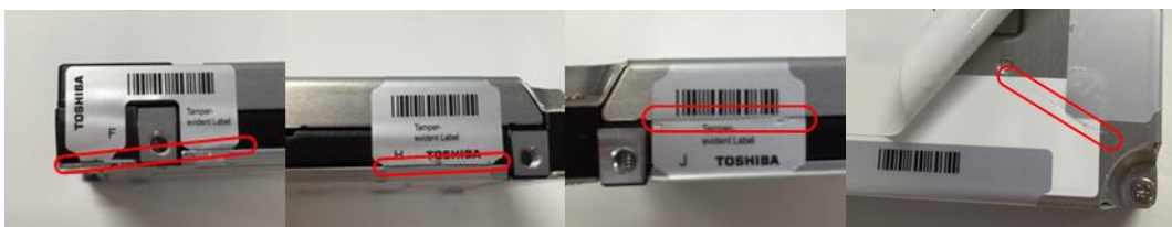
Cutting line (Security seals and OUTER SHEET)