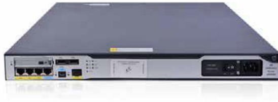
Figure 3 HPE FlexNetwork MSR3024 PoE Router (JG408A)