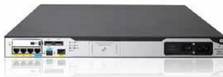
Figure 2 HPE FlexNetwork MSR3024 AC Router (JG406A)