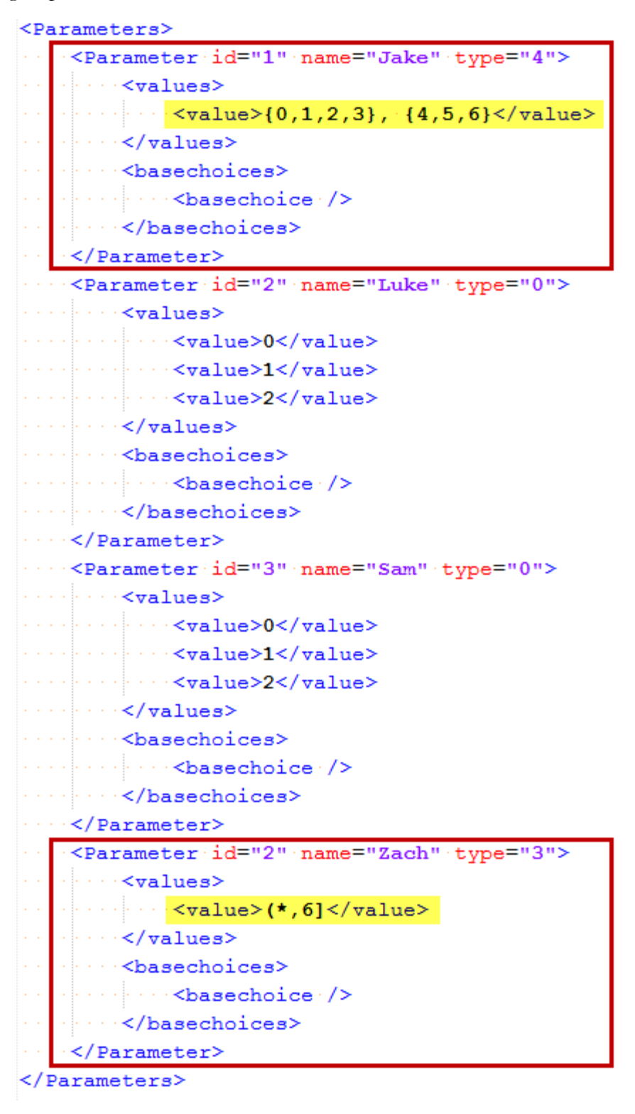
Note : The entire range and group class should be defined in one <value> tag.

Defining these groups in a .xml file would look as follows: