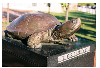
Fig 2. Why is this creature recognized as a reptile?

reptile to Testudo. The prototype ComXAI tool analyzes the presence of combinations of these features in the AwA database animals that are not reptiles. The objective is to identify combinations of reptile features, present in Testudo, that are not present (or extremely rare) in non-reptiles. The presence of these feature combinations should be sufficiently convincing that a reptile has been identified correctly.