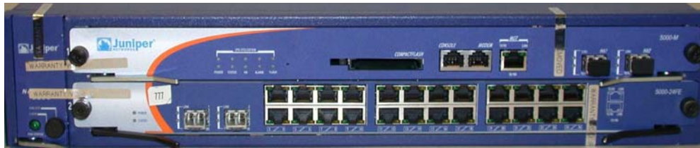
Fig. 4: Front of NetScreen-5200