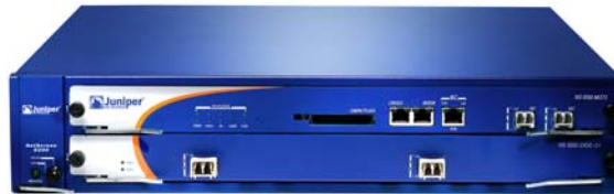
Fig. 1: NetScreen-5200

The entire case is defined as the cryptographic boundary of the module. The NetScreen-5000 series physical configuration is defined as a multi-chip standalone module. The chips are production-grade quality and include standard passivation techniques. The NetScreen-5000 series conforms to FCC part 15, class A.