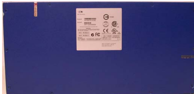
Fig. 6: Rear of NetScreen-5400

Tamper evident seals should be applied to: