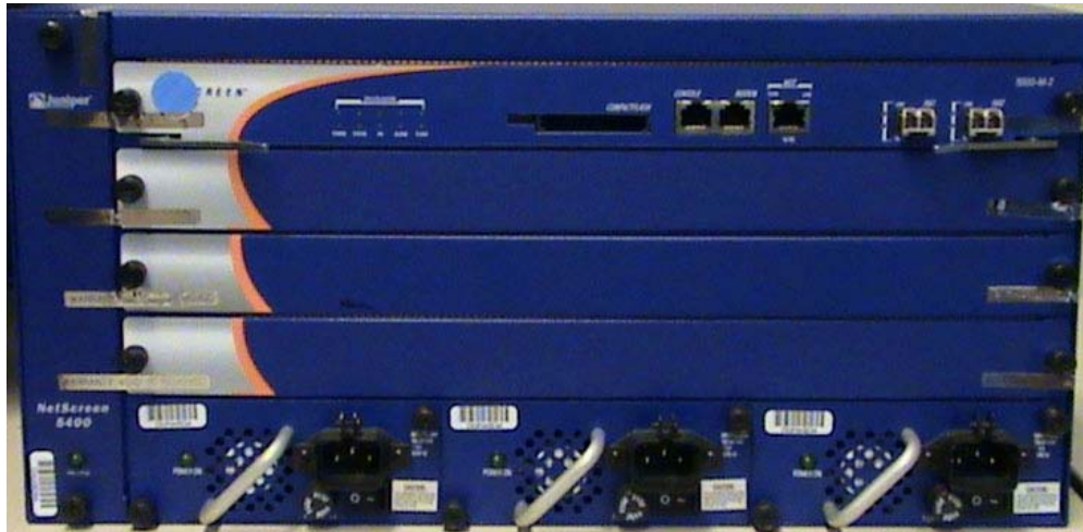
Figure 3: Front of the NetScreen-5400

The administrator must seal the metal enclosure of the device with tamper-evident tape and inspect the seals on a periodic basis to ensure that they are intact. Seals are available for order via part number JNPR-FIPS-TAMPER-LBLS. If a seal is missing or damaged, the device may have been tampered with. Tamper-evident seals should be applied as described below.