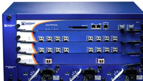
Fig. 2: NetScreen-5400