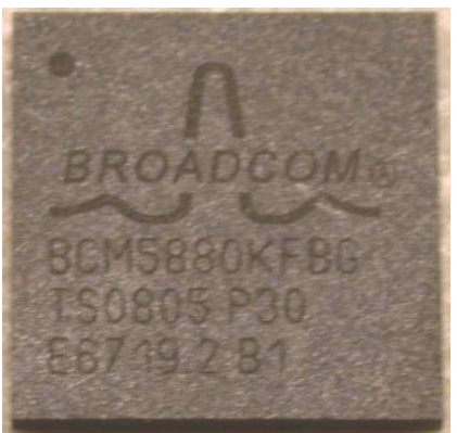
Figure 1 – Image of the Cryptographic Module Physical Boundary

The figures below picture the cryptographic module's physical boundary, interfaces, and logical software execution contexts within the physical boundary.