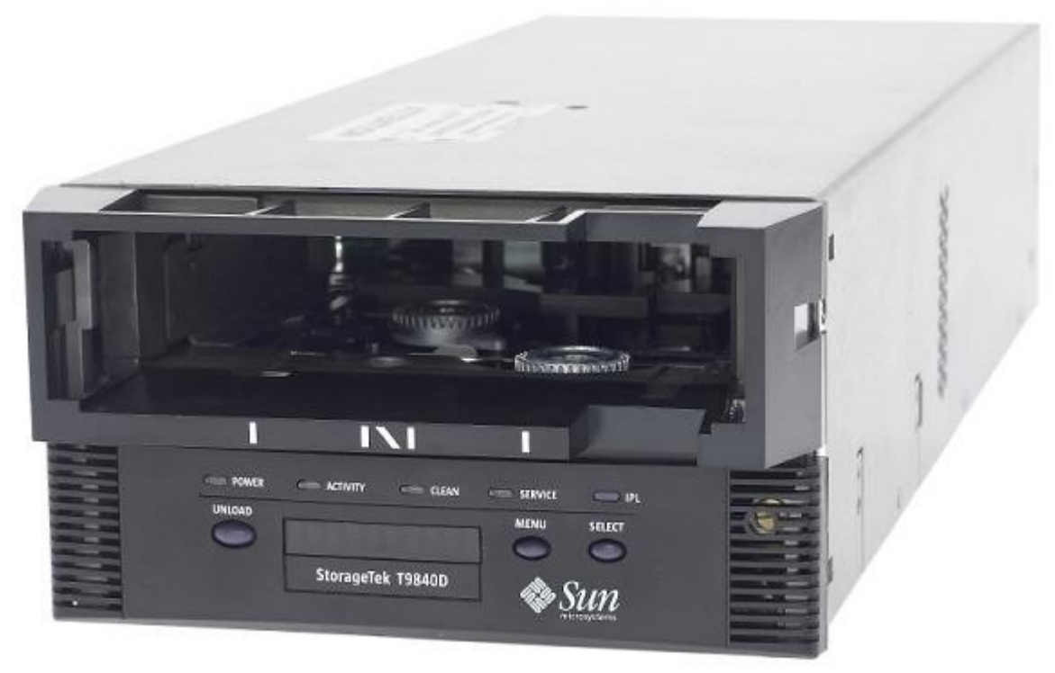
Figure 1.1: Front, side, and top of T9840D

The cryptographic boundary of the ETD is the external surface of the tape drive's commercial-grade metallic enclosure. Figure 1.1 and Figure 1.2 illustrate the cryptographic boundary as defined: