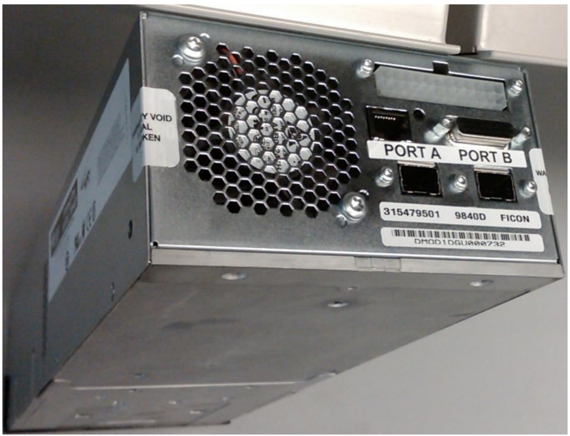
Figure 1.2: Back, side and bottom cover of T9840D

Note: Figure 1.2 appears to be upside-down to show bottom plate.