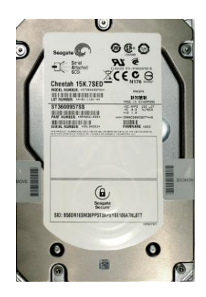
2.5" Form Factor Drive TEL views