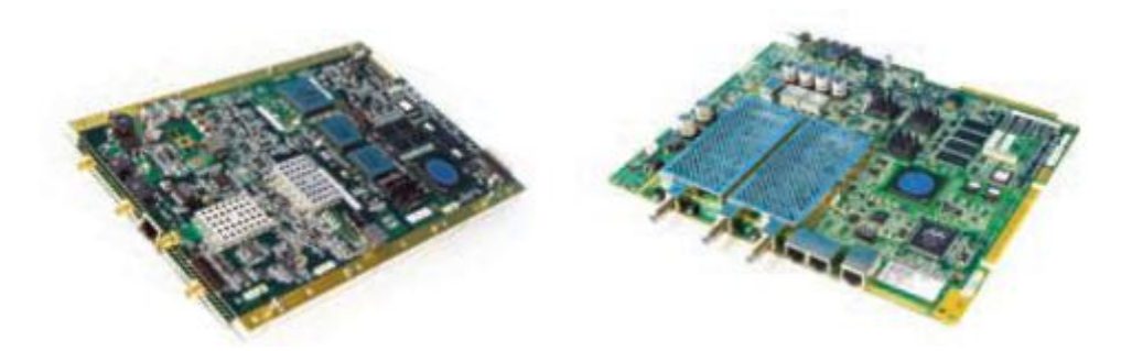
Figure 5 - iNFINITI iConnex 700 and Evolution iConnex e800 Satellite Router Boards

The iNFINITI iConnex 700 and Evolution iConnex e800 Satellite Router Boards are PCBs that consist of production grade components, and are validated as multi-chip embedded modules. Figure 5 below shows the Satellite Router Boards.