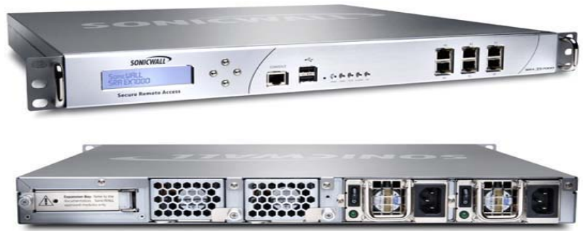
SonicWALL SRA EX7000