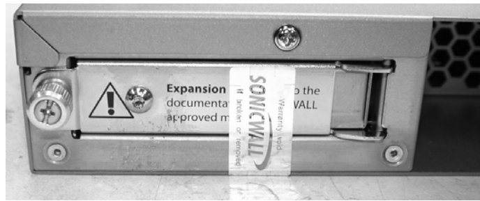
Figure 4: Tamper Seal #3 - Expansion Bay