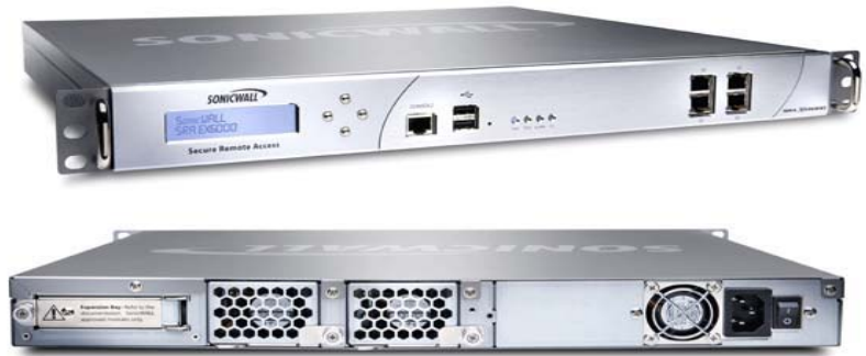
SonicWALL SRA EX6000