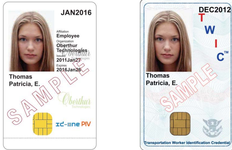
Figure 1: Sample ID-One PIV cards

The following diagram shows in blue the actual module cryptographic boundary.