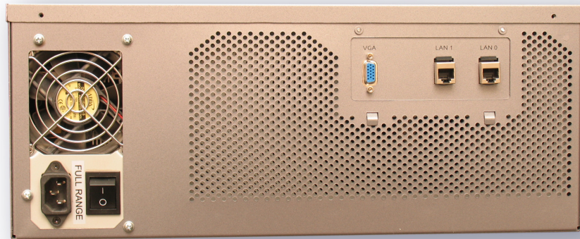
Figure 1 – Front and Rear Interfaces

For FIPS 140-2 purposes, both network ports are treated the same as only encrypted and authenticated sessions are permitted over either port when operating in a FIPS 140-2 compliant manner. In a non-FIPS 140-2 compliant manner, the module could be configured so that traffic over the secure Ethernet port was plaintext while traffic over the unsecure network was encrypted and authenticated.