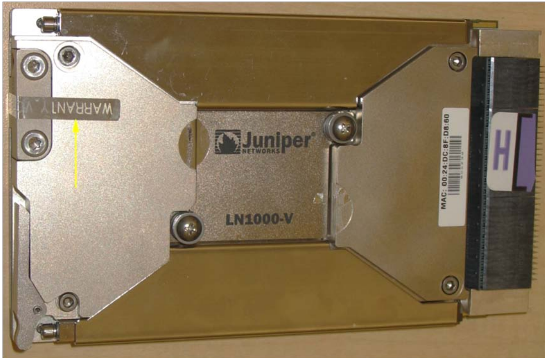
Figure 1. LN1000 Tamper Evident Seal Location (Top)