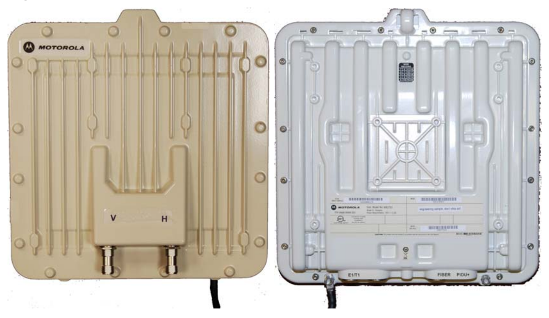
Figure 5: Integrated PTP 600 Unit