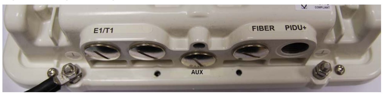
Figure 3: Image showing port identification