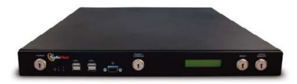
Figure 2.1.1. SafeNet Luna EFT

The loader firmware is implemented as a 32-bit protected mode Intel executable and runs as the only application on a specially cut-down Fedora Core 3 (FC3) Operating System (O/S). The FC3 system launches the loader firmware and provides disk and memory management services and communication services to the loader firmware.