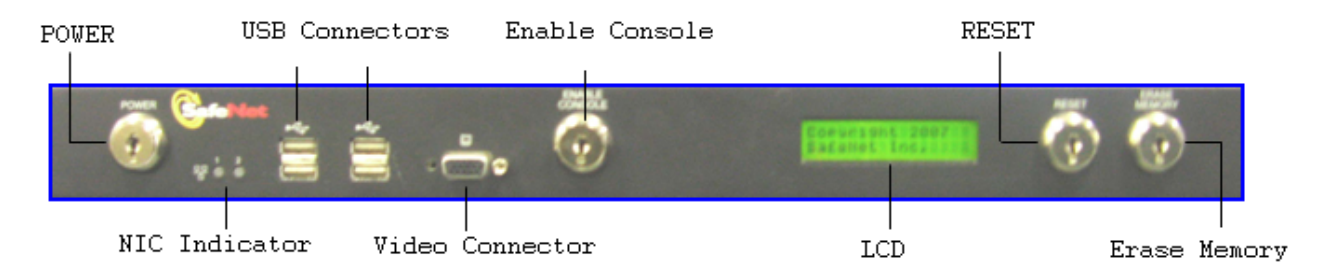
Figure 2.3.1. Front View – SafeNet Luna EFT

The module has the following physical interfaces on the front panel: