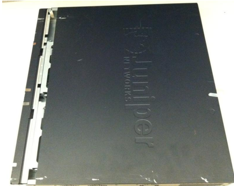
Figure 7: SSG 320M with the cover slid back

To replace or install the dust filter in the SSG 350M, remove the tamper-evident seal #10 from the dust filter tray, replace the previous filter and apply a new tamper-evident seal across the dust filter tray, as shown in figure 5.