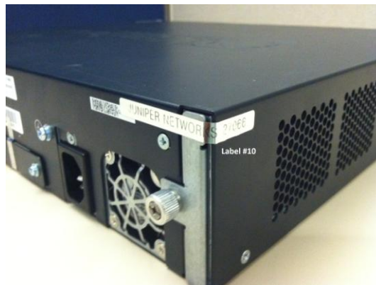
Figure 6: Corner of SSG 350M device showing detail of label #10

Tamper-evident seals should be applied to: