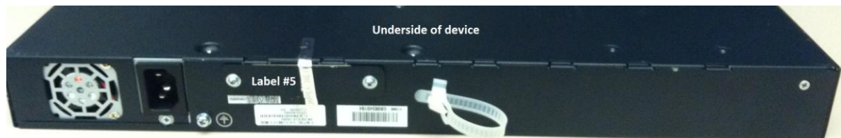
Figure 3: Rear of the SSG 320M device (inverted)

Tamper-evident seals should be applied to front of the 320M, as shown in Figure 2 (4 seals):