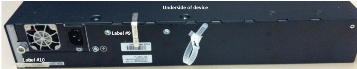
Figure 5: Rear of the SSG 350M device (inverted)