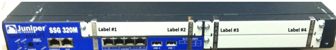
Figure 2: Front of the SSG 320M device