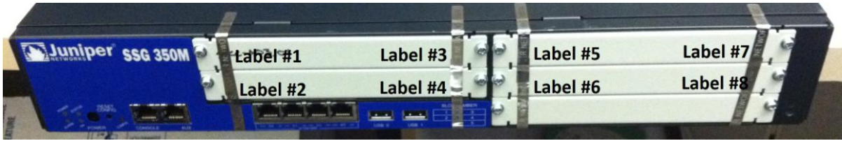
Figure 4: Front of the SSG 350M device