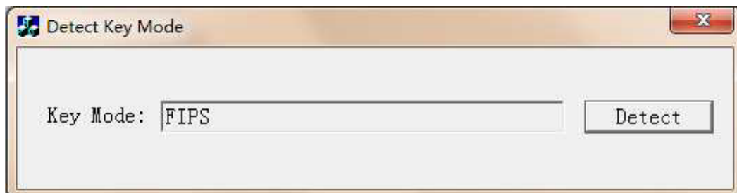
Figure 4 - "FIPS-Mode-Detect" Tool

Another way to determine whether the ST3 ACE Token is a FIPS token is by executing the supplied "FIPS-Mode-Detect" tool. After inserting the module into an available USB slot, start up the tool and hit the "Detect" button. If the tool reports "FIPS", that means the module is configured to operate as a FIPS token. See Figure 4 for a screen shot of the "FIPS-Mode-Detect" tool.