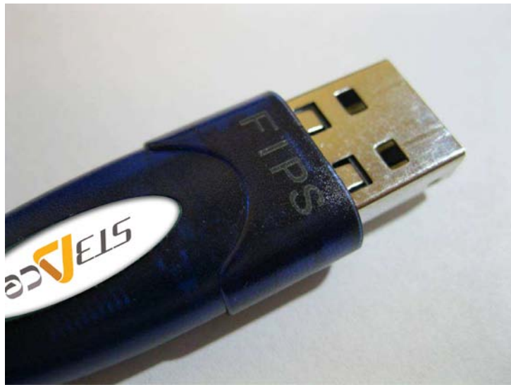
Figure 3 - "FIPS" Label Location

The SECUREMETRIC ST3 ACE Token is shipped as a FIPS token that is already operating in a FIPS-approved mode of operation. It is not possible to change the configuration of the token to operate outside of its shipped configuration. To determine if the token is a FIPS token, the Cryptographic Officer should check for a laser-etched "FIPS" on the token casing, located at the top of the token near the USB connector. Please refer to Figure 3 for the location of the "FIPS" label.