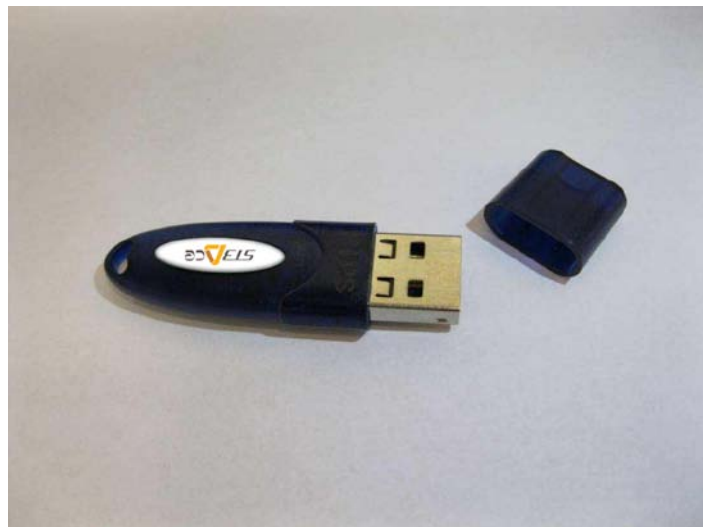
Figure 1 – SECUREMETRIC's ST3 ACE Token

SECUREMETRIC is a leading innovator of smart card and Chip Operating System (COS) based security technologies and applications. Their product offerings include devices that provide software protection, strong authentication, and smart card operating systems. Evidence of SECUREMETRIC's continued leadership and innovation is demonstrated within this Security Policy, which specifies their second FIPS 140-2 validated cryptographic module. This new module, referred to as the ST3 ACE Token, is a USB token containing SECUREMETRIC's own SECUREMETRIC-FIPS-COS cryptographic operating system. The SECUREMETRIC-FIPS-COS is embedded in an ST23YT66 Integrated Circuit (IC) chip and has been developed to support SECUREMETRIC's ST3 ACE USB token (Figure 1). The ST3 ACE Token is designed to provide strong authentication and identification and to support network login, secure online transactions, digital signatures, and sensitive data protection. SECUREMETRIC's ST3 ACE Token guarantees safety of its cryptographic IC chip and other components with its hard, semi-transparent, polycarbonate shell.