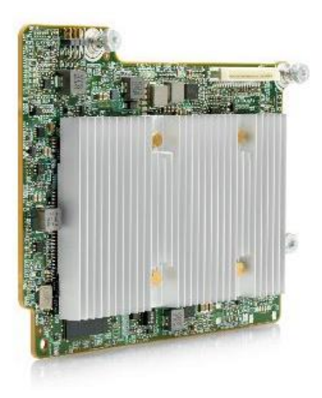
Figure 5 – P741m Controller

The Smart Array Controllers provide encryption for data at rest. Each controller includes a PMC-Sierra ASIC<sup>5</sup> that generates the keys to be used for encryption. The controllers utilize a front-end strategy to encrypt all host data. Data from the host first enters the encryption engine before moving to the cache module and then to the RAID storage. The controllers also include a key management framework for managing disk encryption keys. Each logical drive in the storage array is encrypted with its own disk encryption key. These keys are then encrypted with a second key for storage on the drive. Smart Array stores keys in encrypted form in multiple locations to provide data storage that is secure and mobile. The Smart Array Controllers are validated at the FIPS 140-2 section levels shown in Table 1.