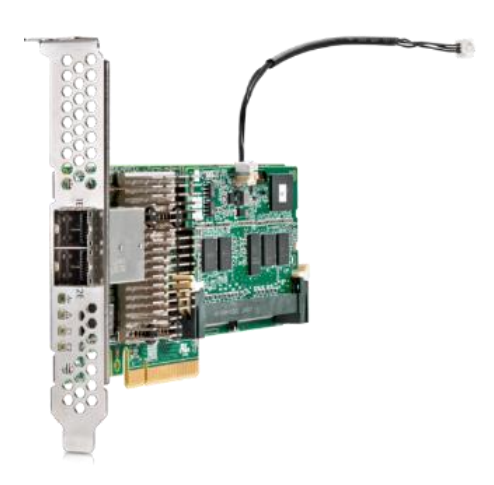
Figure 4 – P441 Controller