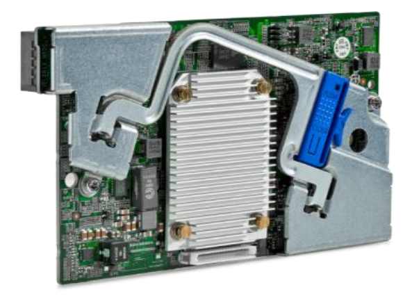
Figure 1 – P244br Controller