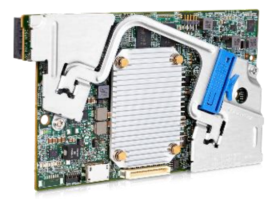
Figure 2 – P246br Controller