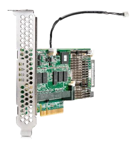
Figure 3 – P440 Controller

HPE P-Class Smart Array Gen9 RAID Controllers