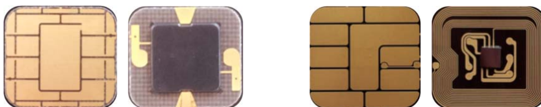
Figure 1 – P-M8.4-8-3 front and back (left); S-COM6.8 front and back (right)

The contactless ports of the Module require connection to an antenna. The Module relies on [ISO7816] and [ISO14443] card readers as input/output devices. Control/data input and status/data output share a common physical port, with the logical separation into interfaces determined by the ISO 7816 and ISO 14443 protocols.